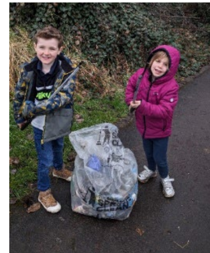
Left Photo: Woodhead Road after 26/2/24 overnight closure & street cleansing Right Photo: Young PickFit volunteers at Manor Park, High Peak

*All inspections were completed however if adverse weather prevented on time inspection even by a few days it may fall into the following quarter