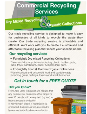
Photo: : New Trade Waste leaflet promoting our services & highlighting the Simpler Recycling law change from April 2025 requiring organisations with over 10 employees to recycle